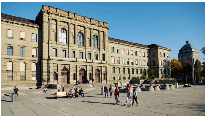
The main building, designed by Gottfried Semper, opened in 1864.