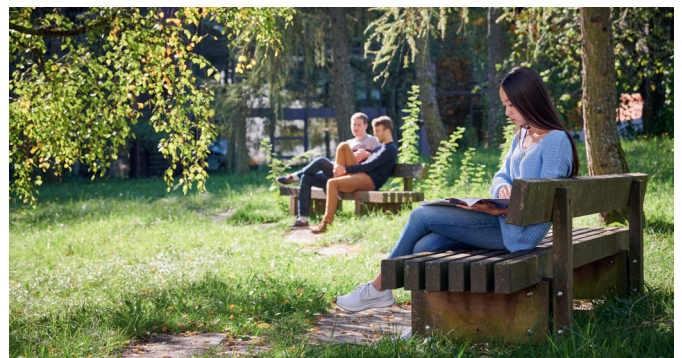
Green space on Hönggerberg campus for studying and socialising

Over twenty Nobel laureates have studied, taught or conducted research at ETH, underlining the university's excellent reputation. Also, ETH regularly features in international rankings as one of the best universities in the world. Students can choose between 24 Bachelor's degree programmes and over 40 Master's degree programmes.